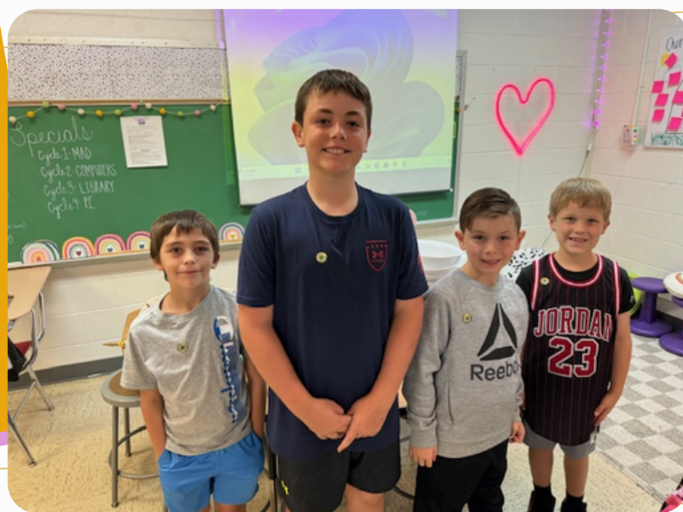
Buis's 3rd Grade