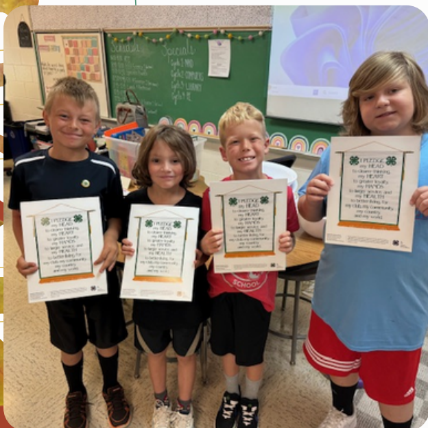
Sear's 3rd Grade