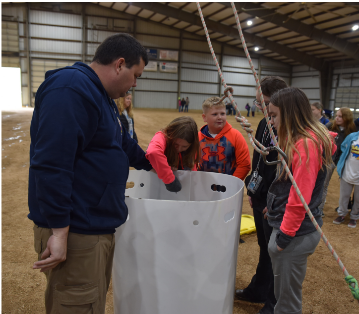
Pictured above: Students are learning how to put together a “turtle tube” a sleeve that is used for rescuing people trapped in grain bins.

Over 120 5th grade students were in attendance and all were able to go home with more knowledge on the importance of safe practices in agriculture.