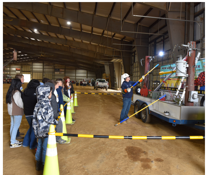
Pictured below: Students watch as a volunteer from Inter-County Energy Cooperative demonstrates electrocution of a hot dog on a power line.